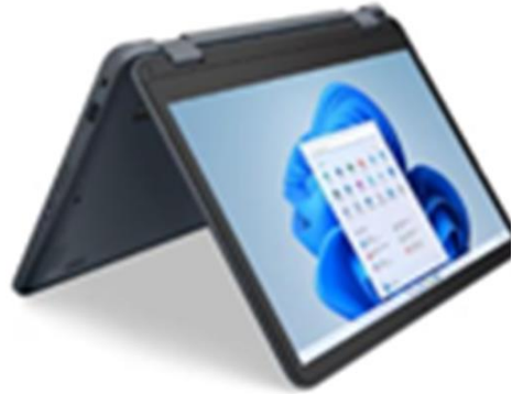
Lenovo 300w Yoga Gen 4