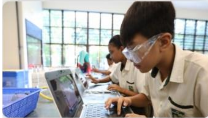
Support Self-Directed and Collaborative Learning